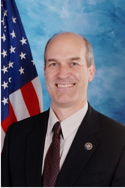
Rep. Rick Larsen (WA-02)