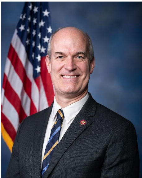
Rep. Rick Larsen (WA-02) Click here for headshot