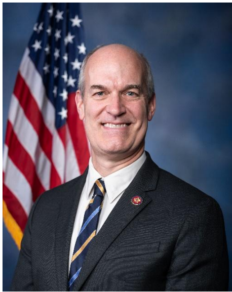
Rep. Rick Larsen (WA-02) Click here for headshot